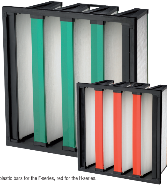
Green plastic bars for the F-series, red for the H-series.

The Cam GT is a high-capacity filter for turbo machinery. Due to the unique design its performance is maintained in humid or wet conditions, guaranteeing a long lifetime and a good filter economy.